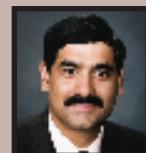
General Session -2