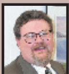
General Session - 4