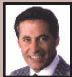
General Session -1

Expert Speakers Timely Topics Sound Solutions