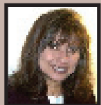
General Session - 8