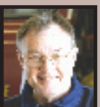
General Session - 7