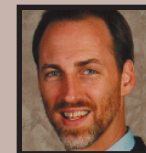
General Session - 9