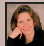
General Session - 6