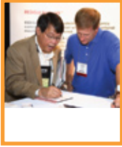
Exhibit Hall Events and Highlights